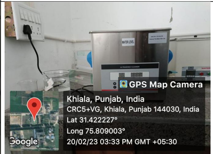
16. High Precision Digital Bath