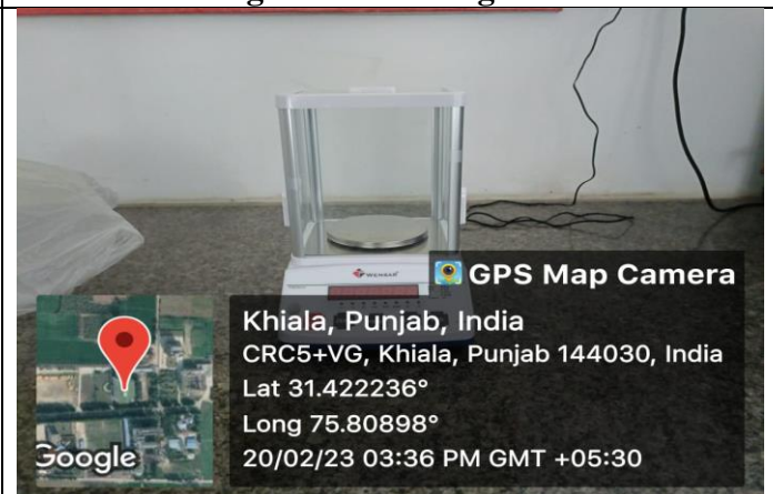
18. Digital Weighing Balance