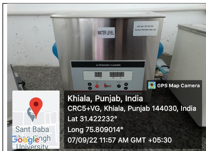
1. Ultrasonic Bath