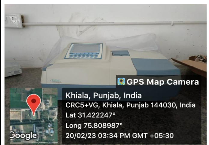
6. UV Visible Spectrophotometer ELISA Reader