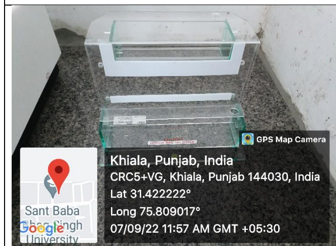
5. Vertical Gel Electrophoresis Unit