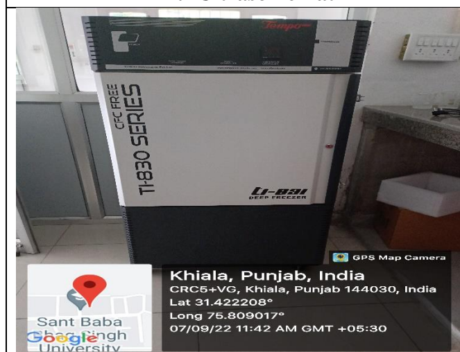
3. Deep Freezer