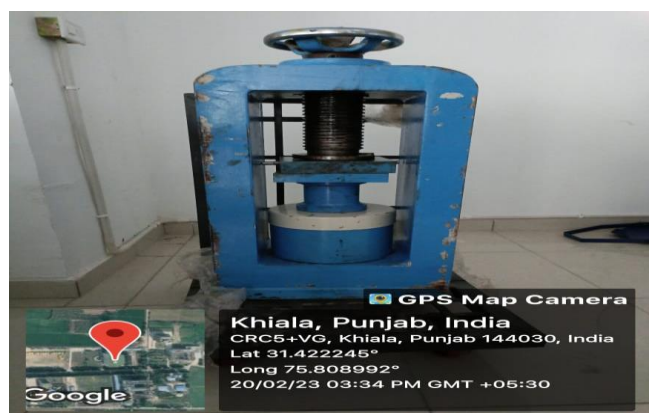
17. Compression Testing Machine (200 kN)