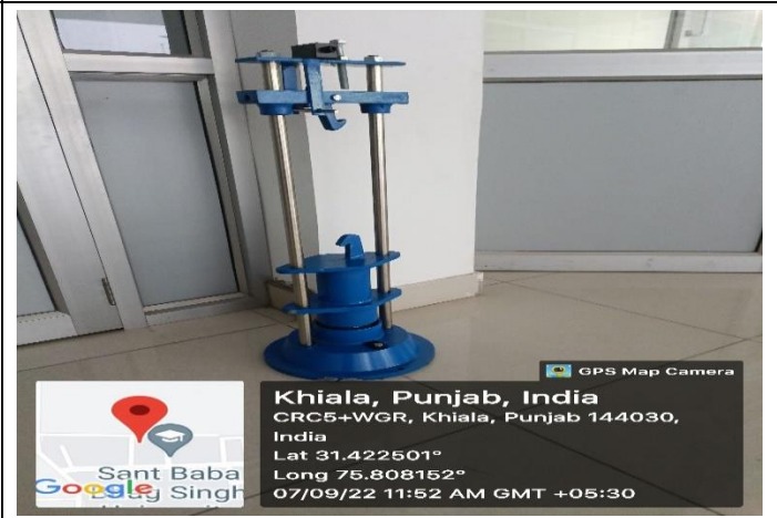
10. Aggregate Impact Testing Machine