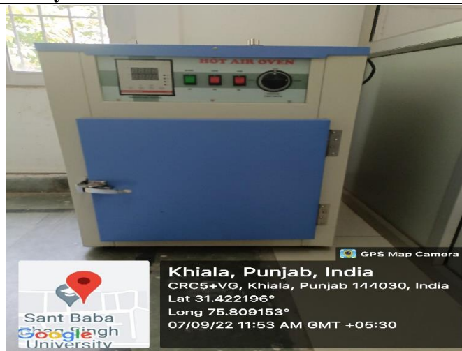
15. Hot air Oven