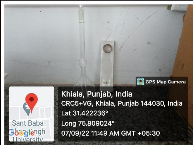
14. Slump Test Apparatus