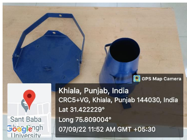
11. Vicat Apparatus