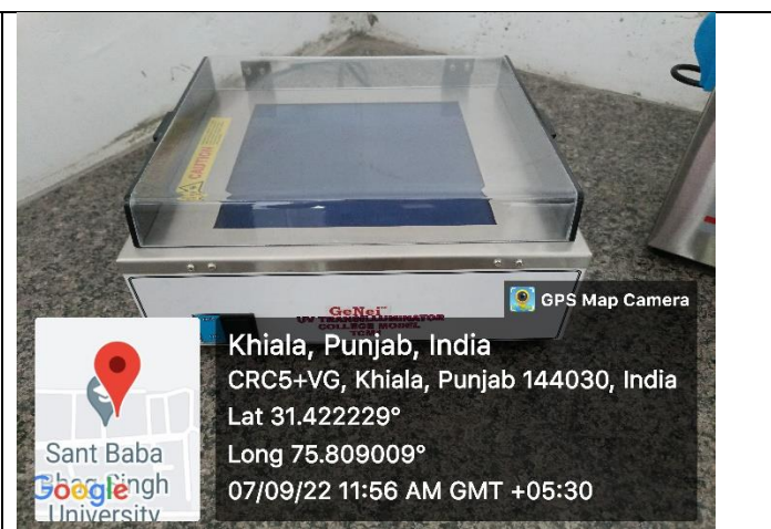
2. UV Transilluminator