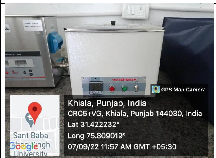
4. Water Bath