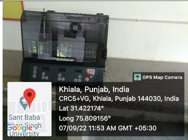
7. Shaker Incubator